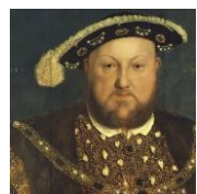
Henry VIII and his six wives