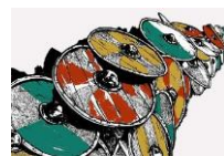
Why did William win the Battle of Hastings?

The importance of chronology and historical sources.