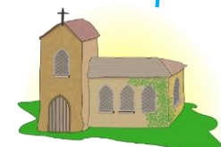
What was life like in the Middle-Ages?