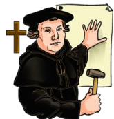
REFORMATION DAY The Reformation and Henry's split with Rome