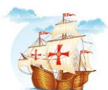
How did the English defeat the Spanish Armada?