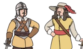
Why did the English Civil War start?