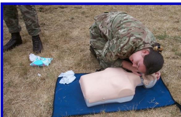
ANNUAL CCF CAMP

REGROUP!" Across the grassy flatlands of Carnoustie, Delta Fire team pelted forward to join their section commander, flanking around the captured enemy position. It was already the fifth day on the Barry Buddon training area and, after the previous day's patrols and a night ambush in pitch darkness, Montsaye Academy CCF had finally triumphed against the forces of the 'Barry Buddon Boys', the final challenge in Operation Striking Lion. Twenty-one cadets, four staff and six days of activities on the Scottish coast – it seems daunting even on paper, but every student committed to the adventure with maturity and resilience, even when the going got tough. Whether shooting live rounds on the target range, patching up the pretend wounds of fake-bloodied casualties, or storming the assault course, the cadets did the school proud.