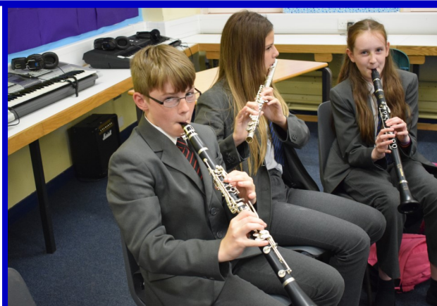
Year 7 students enjoying their woodwind lesson

There will not be extra village buses, so students who this affects are to either come in on the normal village bus and report to the library or make alternative arrangements to enable them to arrive for 11.00am.