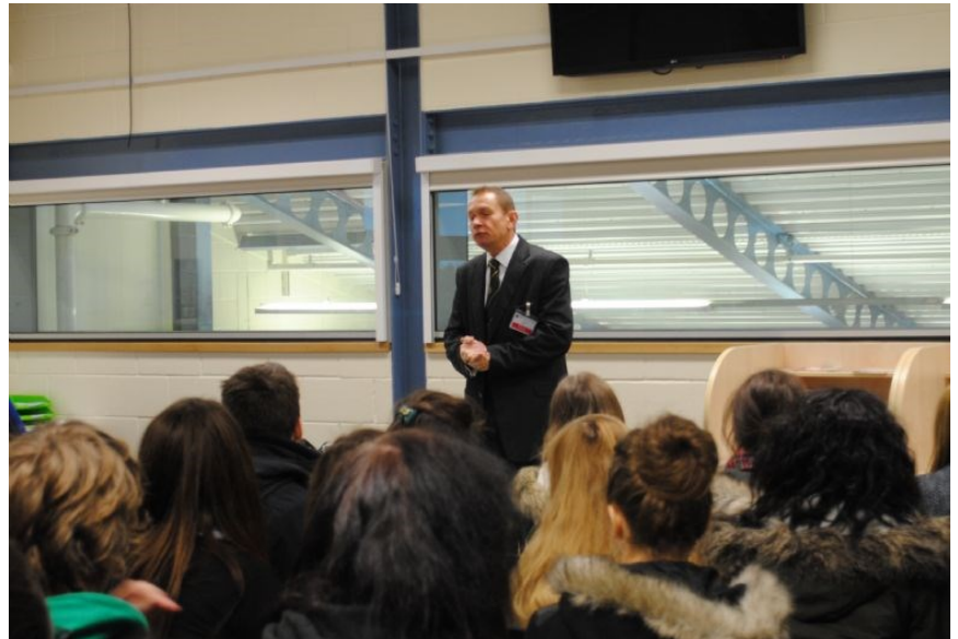
Philip Hollobone MP visiting the 6th Form earlier in 2015