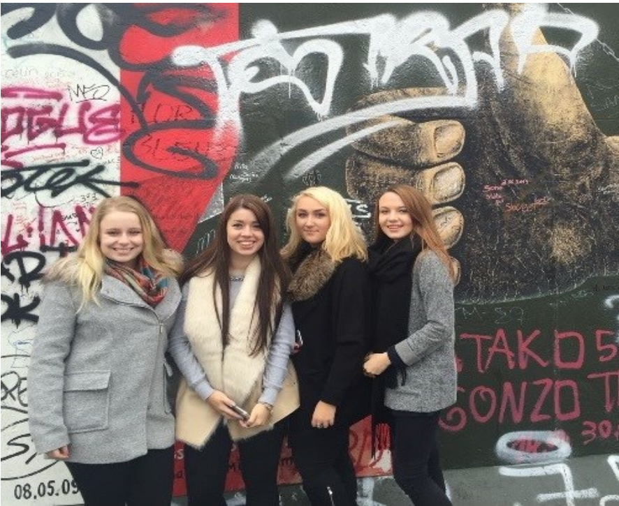
Year 13 Historians stood in front of the Berlin Wall