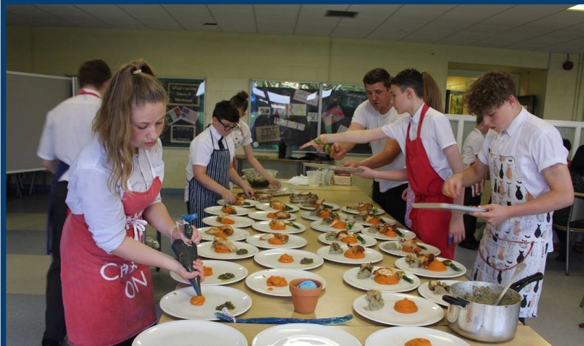
Montsaye students working with chefs from the Tollemache Arms

At Montsaye, we've worked hard over the past twelve months to ensure that our students continue to get an excellent quality of teaching in the classroom.