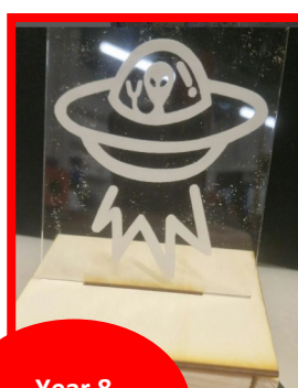
Year 8 Light Boxes

Are you interested in the work which our design department do? Why not follow them on their newly launched Instagram page?