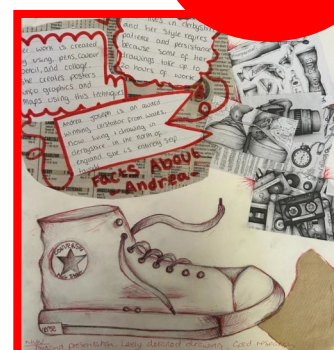
Year 9 Artist Study

Keep up-to-date with the creative successes of our wonderful students. The account showcases a wide range of activities, including work in food tech, art, photography and textiles.