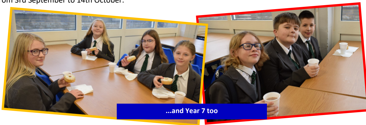
...and Year 7 too

Early morning hot chocolate and doughnuts have been a welcome start to the school day during form time. Students earned the treat by registering 100% attendance during the first half term of this academic year, running from 3rd September to 14th October.