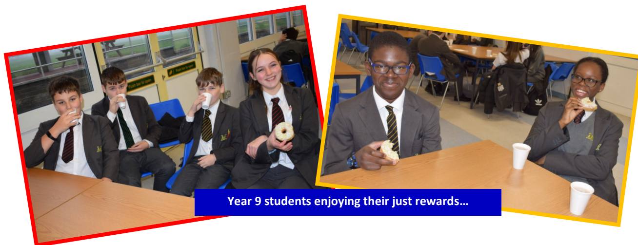
Year 9 students enjoying their just rewards...

Over the course of the last few weeks, progress leaders have been celebrating 100% attendance with their year group.